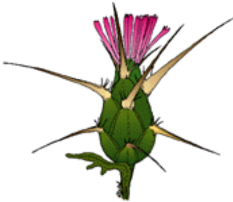
Flower head of purple starthistle.

Do not mow purple or Iberian starthistles. Rosettes are too low to be mowed. Mowing older plants encourages development of multiple rosettes from one root base, and spreads purple starthistle by throwing seed heads.