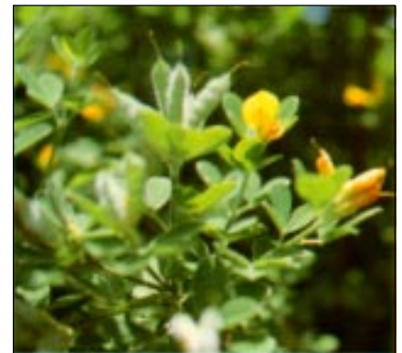
Figure 3.—French broom.