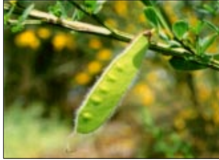
Figure 5.—Scotch broom green seedpod.