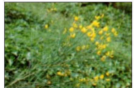
Figure 2.—Spanish broom.