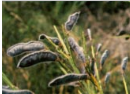
Figure 6.—Scotch broom brown seedpod.