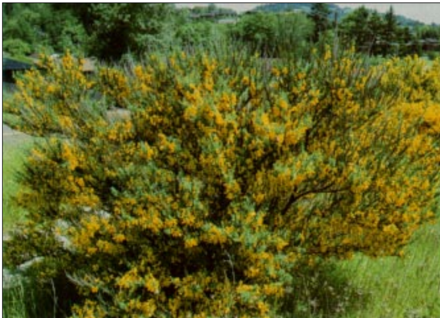
Figure 1.—Scotch broom.

Also, it is reported that ants aggressively collect the seed of Scotch broom, assisting in dispersal. Birds also assist with spread, but how well the seeds survive digestion varies with the species of bird.