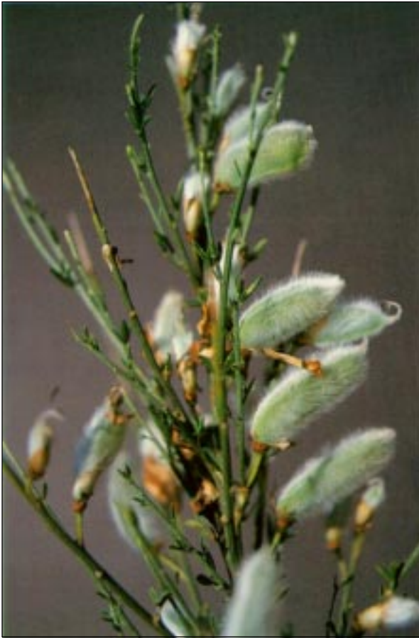
Figure 4.—Portuguese broom.